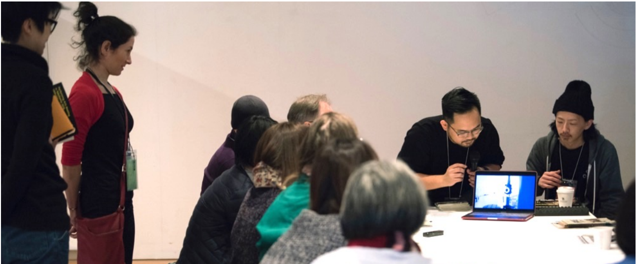
TPAM Exchange: Group Meeting (TPAM2018,)

Professional participants can make the most of TPAM Exchange as an opportunity for promoting productions, gaining information and networking, but also general audience can participate in it except some specifically professional programs. A variety of programs including an opening symposium where Asian artists and the TPAM advisors Oriza Hirata and Toshiki Okada will reflect on the Asian focus since 2015, “Performing Arts AiR Meeting” for the networking of Artist-in-Residence facilities and programs in the sector, public symposia by Open Network for Performing Arts Management (ON-PAM) and an international training program for Asian creators of the next generation are to be announced. Please visit the website or contact us for the latest information.