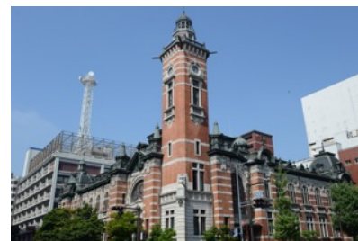
Yokohama Port Opening Memorial Hall