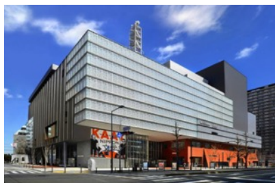
KAAT Kanagawa Arts Theatre